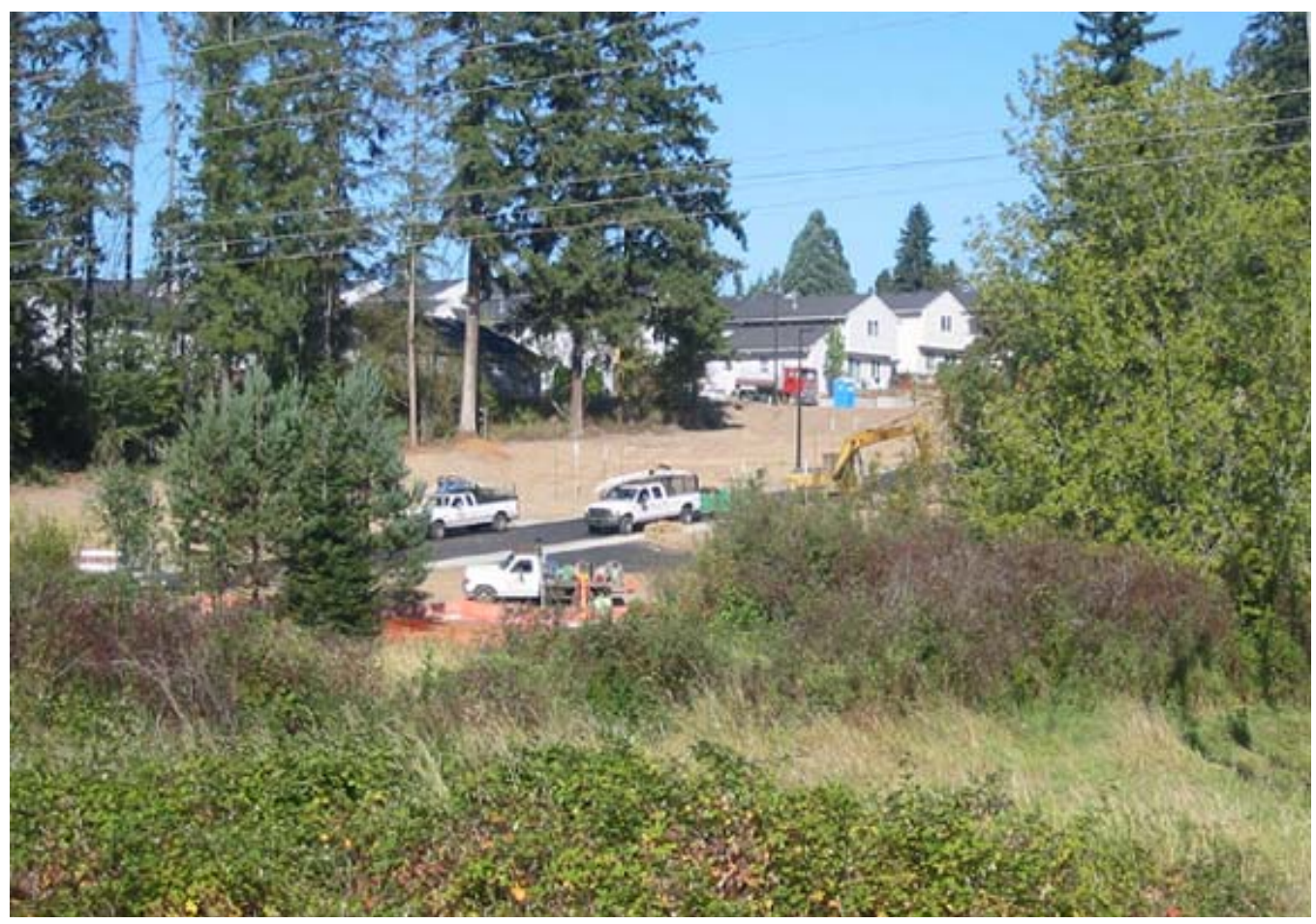
The construction of new neighborhoods is one cause of habitat loss and fragmentation, and one reason why parks, such as the power–line trail park in the foreground, are increasingly important refuges for pollinators and other wildlife.

Fragmentation of habitat is a second threat. The patches of habitat left after conversion to housing, industry, or agriculture—such as hedgerows or grassy verges—might be too small to support adequate nest sites, hostplants, or forage areas. Or, they may be too far apart. Although bees do not require large, contiguous areas of habitat, patches need to be within flying distance of each other. Most bees fly a couple of hundred yards or less between nest and forage. Butter-flies can also suffer if habitat is too fragmented.