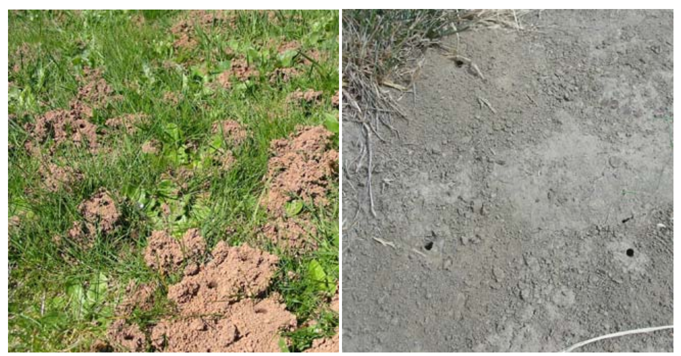
Two examples of ground nests. On the left are the small mounds (tumuli) that surround the entrance to each nest of mining bees; there may be as many as thirty nesting bees per square foot. On the right is a sweat bee nest site. These nests are marked by little more than a small hole in bare ground. When the site is active, you may notice the constant movement of low–flying males searching for emerging females.

Bumble bee nests. Bumble bees require a small cavity, such as an abandoned mouse nest. Most