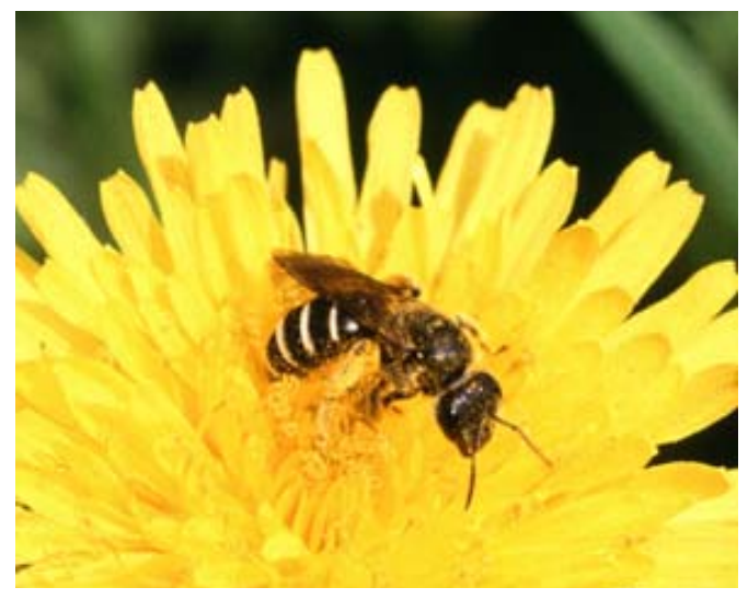
Many native bees are tiny, as demonstrated by this photograph of a sweat bee that is dwarfed by the dandelion on which it forages.

Keep in mind that the yellowjackets you see eating rotting fruit and hanging around picnics are not bees, nor are they significant pollinators.