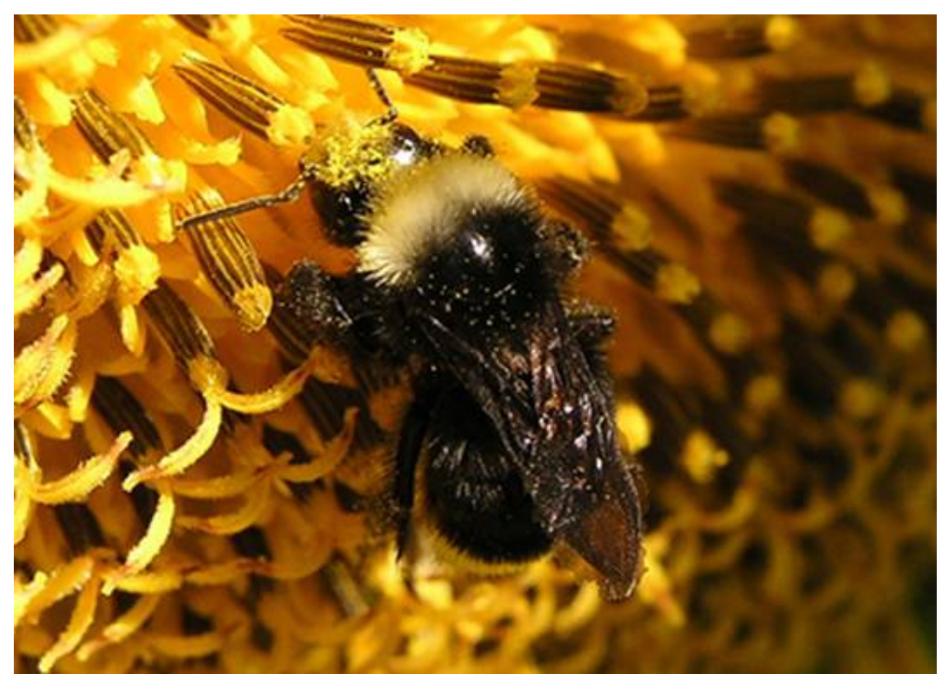
Large, hairy, and usually black with yellow, orange, or white stripes, bumble bees are easy to recognize. These native bees are important pollinators, and are among the first bees to be active in late winter or early spring.

In addition, pollinators help plants in other ways beyond pollinating flowers. The tunneling activities of ground-nesting bees, for example, improve soil texture, increase water movement around roots, and mix nutrients into the soil. The larvae of pollinating beetles that tunnel in old trees increase soil fertility by helping to break down decaying wood, thus returning the nutrients locked away in the tree back into the ecosystem. The larvae of many syrphid flies (as adults, important pollinators of many plants) reduce damage to plants by eating aphids and other soft-bodied plant pests.