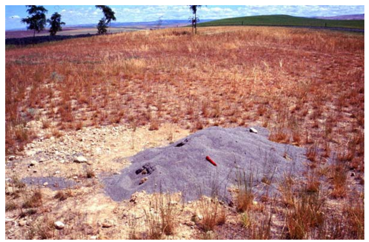
Provide potential nesting habitat for ground-nesting bees by clearing vegetation to create a patch of bare ground, or by digging a pit and filling it with sand.

The most straightforward approach to providing nesting habitat is to clear some of the vegetation from a gently sloping area in an undisturbed spot. Choose a site that is well drained, in an open sunny place, and, where possible, on a southeast–facing slope. Remove the dense root mat and thatch layer to give bees access to the soil below. Leave some clumps of grass or other low–growing plants to reduce erosion. You might also place a few rocks in the cleared area for bees to bask on. Different ground conditions—from vertical banks to flat ground—will draw different bee species. Create suitable habitat in a variety of areas, determine which ones ultimately attract bees, and adjust your conservation plan as necessary.