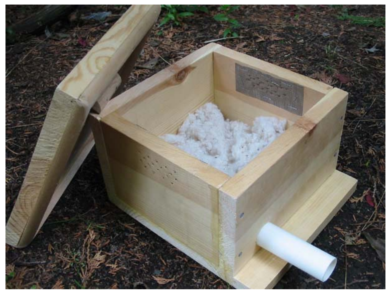
In the spring, bumble bees emerge from hibernation and search for a place to establish a colony. They naturally nest in a cavity in the ground or in a tree, but may adapt to a wooden box filled with soft nesting materials and fitted with an entrance pipe.

there is no risk of flooding. The box should be on or just under the ground. If you bury it, extend the entrance tube so it gently slopes up to the surface. Put the nesting box out when you first notice bumble bees in the spring, or when the first willows and other flowers are blooming. If there are no inhabitants by late July, put the nesting box into storage until the next spring. If the box is occupied, at the end of fall remove the old nest materials, clean the box with a mild bleach solution, and put in new nesting materials before returning the box to its location.