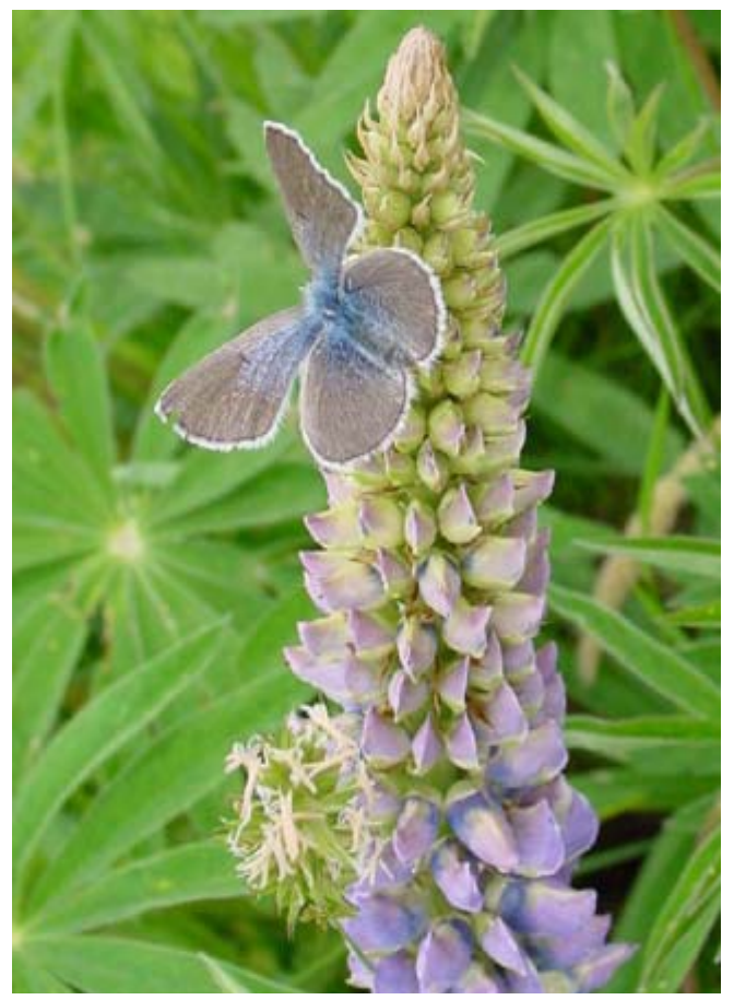
Hostplants on which caterpillars can feed are a critical part of butterfly habitat. Here, a silvery blue lays eggs on a broadleaf lupine.