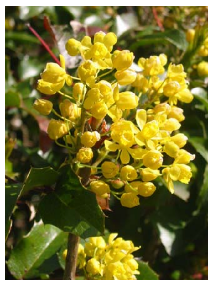
Good colors of flowers for bees are blue, purple, violet, white, and yellow (such as this tall Oregon grape). Butterflies like many of these colors and are also attracted by red.

Research shows that sites with at least eight species of plants flowering simultaneously attracted a greater number and diversity of bees. This strategy will enhance your park's ability to attract and keep pollinators.