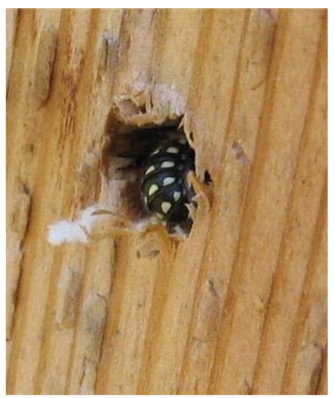
Distinctive white or pale yellow markings on its abdomen, as well as the cottony tufts at the entrance to its nest, help to identify this pollinator as a carder bee. Carder bees use downy hairs scraped from the leaves of plants such as mullein or lamb's ears to divide the nesting tunnel into brood cells.

Some solitary wasps might also occupy the nest blocks. Wasps are predators and will stock their nests with larval or adult insects or spiders.