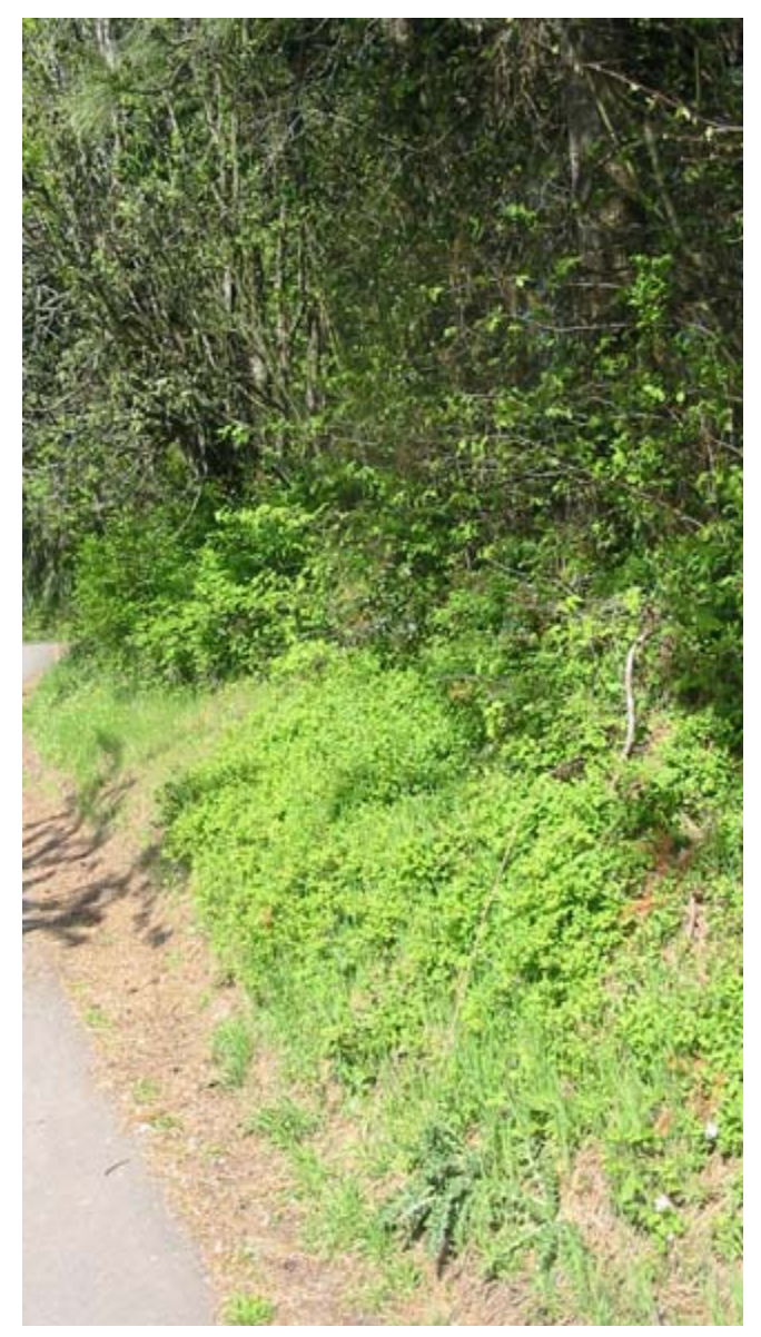
Sun-dappled forest edges can make excellent foraging habitats. Annual and perennial forbs, as well as flowering shrubs, provide nectar and pollen. The forage plants on this bank include Oregon grape, cascara, snowberry, and dewberry. Forest edges tend to have sparsely vegetated soil as well as mature trees, both good places for nests.

plant sources such as muddy puddles, animal carcasses, dung, and urine. You may want to allow some fruit to rot or to provide a water source. Dampen a shallow depression of sand and let it dry out each day. A moist area from a (deliberately) dripping irrigation nozzle or water-filled plastic jug will also suffice.