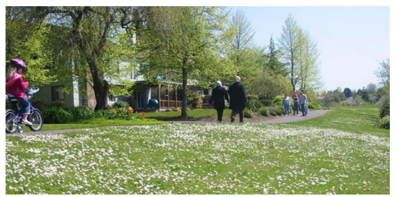
Parks provide many recreational opportunities and environmental benefits to neighborhoods and local communities.

Recent studies demonstrate the value of parks and other greenspaces for wild pollinators—even fragments of habitat in urban areas. For example, San Francisco's parks support significant, and diverse, populations of bumble bees. Fifty species of bees were discovered in parks in the northern areas of Bronx, New York, and sixty-two species of bees were found in fragments of desert scrub habitat in Tucson, Arizona. More than seventy species of bees were