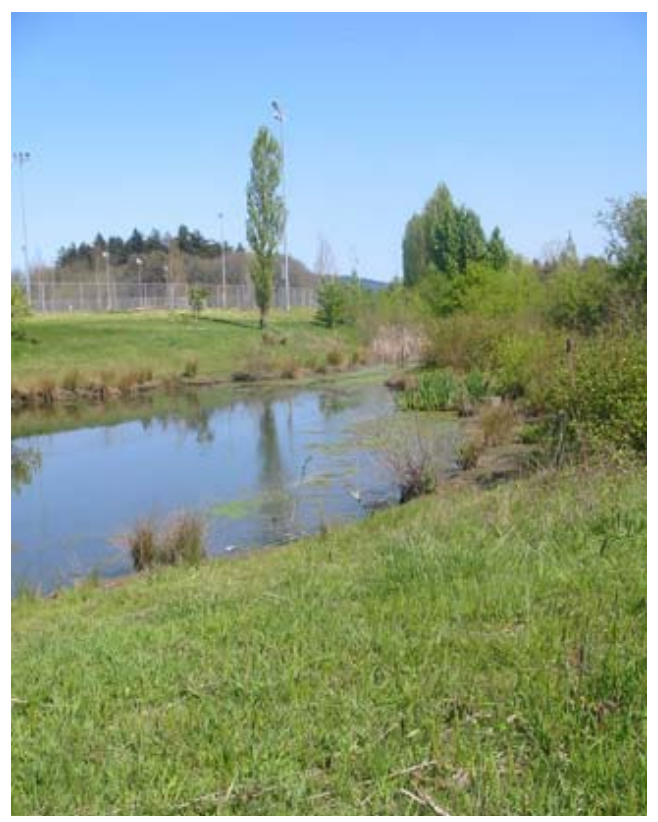
Creek banks, hedgerows, and awkward corners by sports fields are among the areas that contain pollinator habitat.

To a great extent, good hostplant areas will be the same as good foraging areas. Diverse forage patches will almost certainly include a variety of hostplants. Because the caterpillars of many butterflies feed on trees, be sure to inventory your tree resources. For example, hostplants of the tiger swallowtail include willow and black cottonwood, Propertius duskywing caterpillars feed on Garry oak, and cedar hairstreak