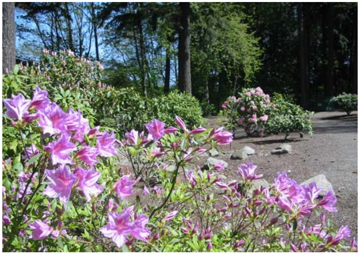
Pollinator conservation can be incorporated into any area of a park, including places traditionally not considered to be wildlife habitat. Formal landscaping, such as the rhododendron garden shown here, offer sources of nectar and pollen.

flower structure. In the process, they may have inadvertently lost their ability to produce nectar and pollen. Modern roses, for example, may have multiple petals in the place of pollen-bearing stamens. Wooden blocks and similar bee nest sites can be a helpful, even attractive, component of these areas.