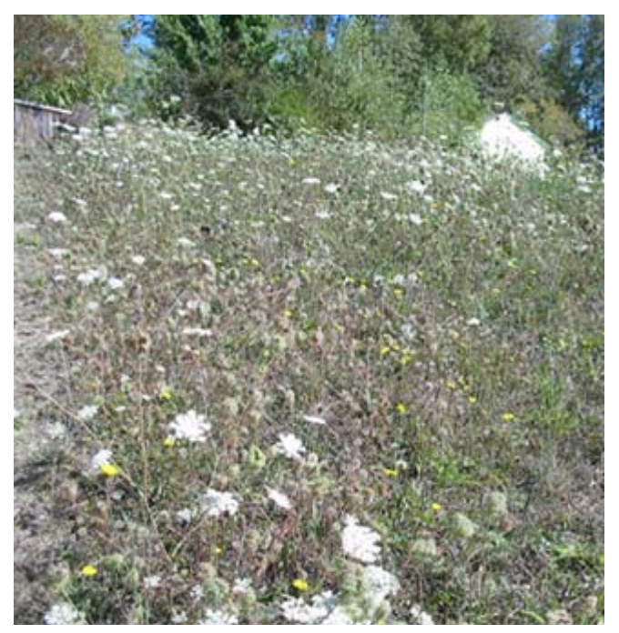
The best foraging patches have a range of flowers that bloom throughout the season, providing nectar and pollen, nesting materials for bees, and caterpillar hostplants for butterflies.

Your park may already support pollinators in areas such as forest edges, hedgerows, riparian areas, utility easements, and conservation areas, as well as unused land around maintenance buildings and service areas. These sites have relatively stable conditions that allow forage plants, butterfly hostplants, and bee nests to become well established. Careful management of these areas and protecting them from pesticides may create more nesting and foraging opportunities for pollinators. Existing habitat may also be enhanced with the addition of key native flowering plants and/or nesting materials.