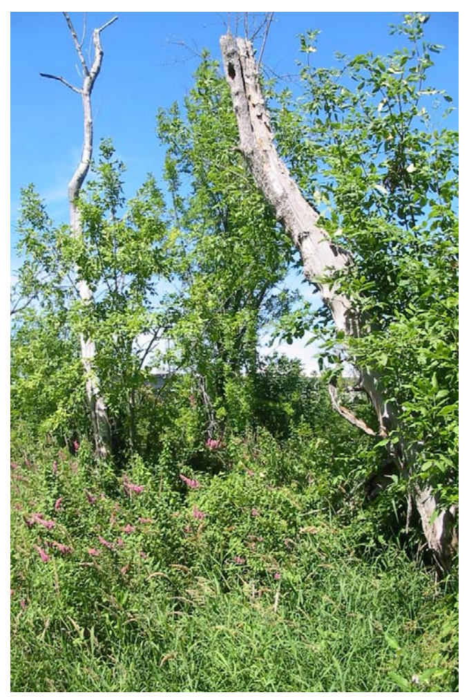
Native pollinators can utilize a variety of habitats. The snags in this photograph might serve as an important nesting place for wood-nesting bees.

areas may be a critical additional step for maintaining pollinators throughout the hot summer months.