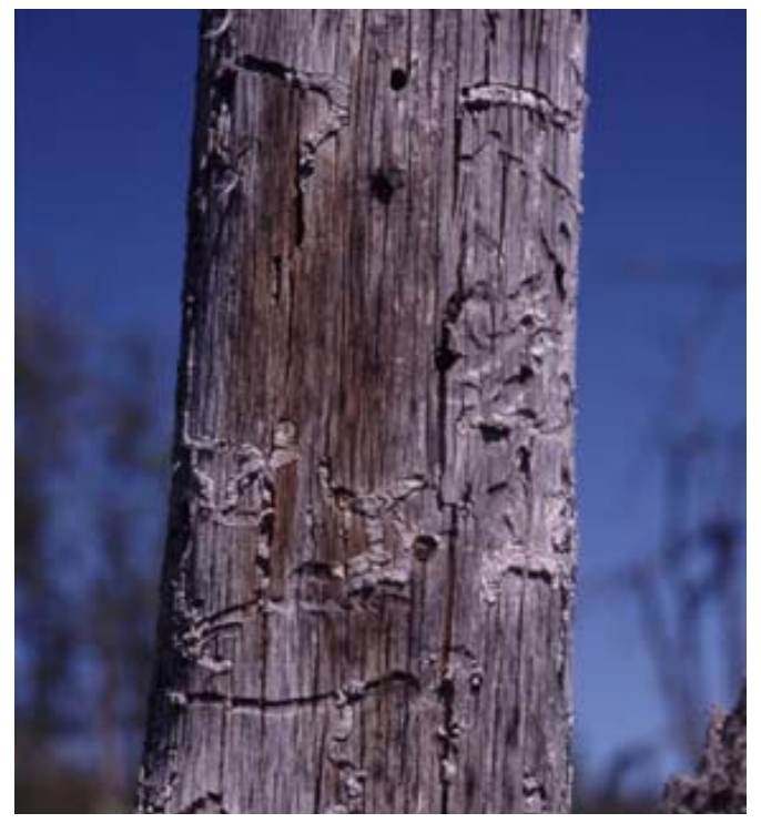
Beetle–tunneled snags, like this one, and patches of bare ground are important nesting sites for solitary bees.

As social bees that live in a colony, bumble bees need a small cavity, such as a discarded mouse nest, in which to build a cluster of waxy, pot-shaped brood cells. A queen founds a colony in spring after she emerges from hibernation. Depending on the species, the colony may be active for only a few weeks or for several months into the fall, at which time most members of the colony die. The last brood to emerge from a colony are queens and males; they mate, the males die, and the mated queens enter hibernation.