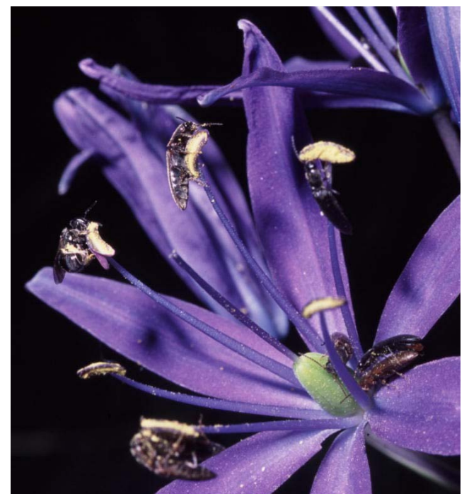
Flowers providing nectar and pollen are a necessary part of pollinator habitat.

Secure, stable nesting sites and flower-rich forage areas are key components of pollinator habitat. The outright loss of this habitat is the greatest direct threat to pollinators. Sometimes the loss is dramatic—a meadow converted to a shopping mall, for example but often it is more subtle. Sites may remain green but still lose plant diversity or nest sites; an agricultural field or an expanse of mown grass usually is of little interest to a bee or butterfly.