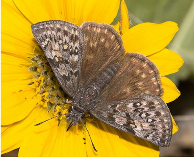
The Propertius duskywing nectars on many flowers as an adult, but its caterpillars will only eat Garry oak in this region.