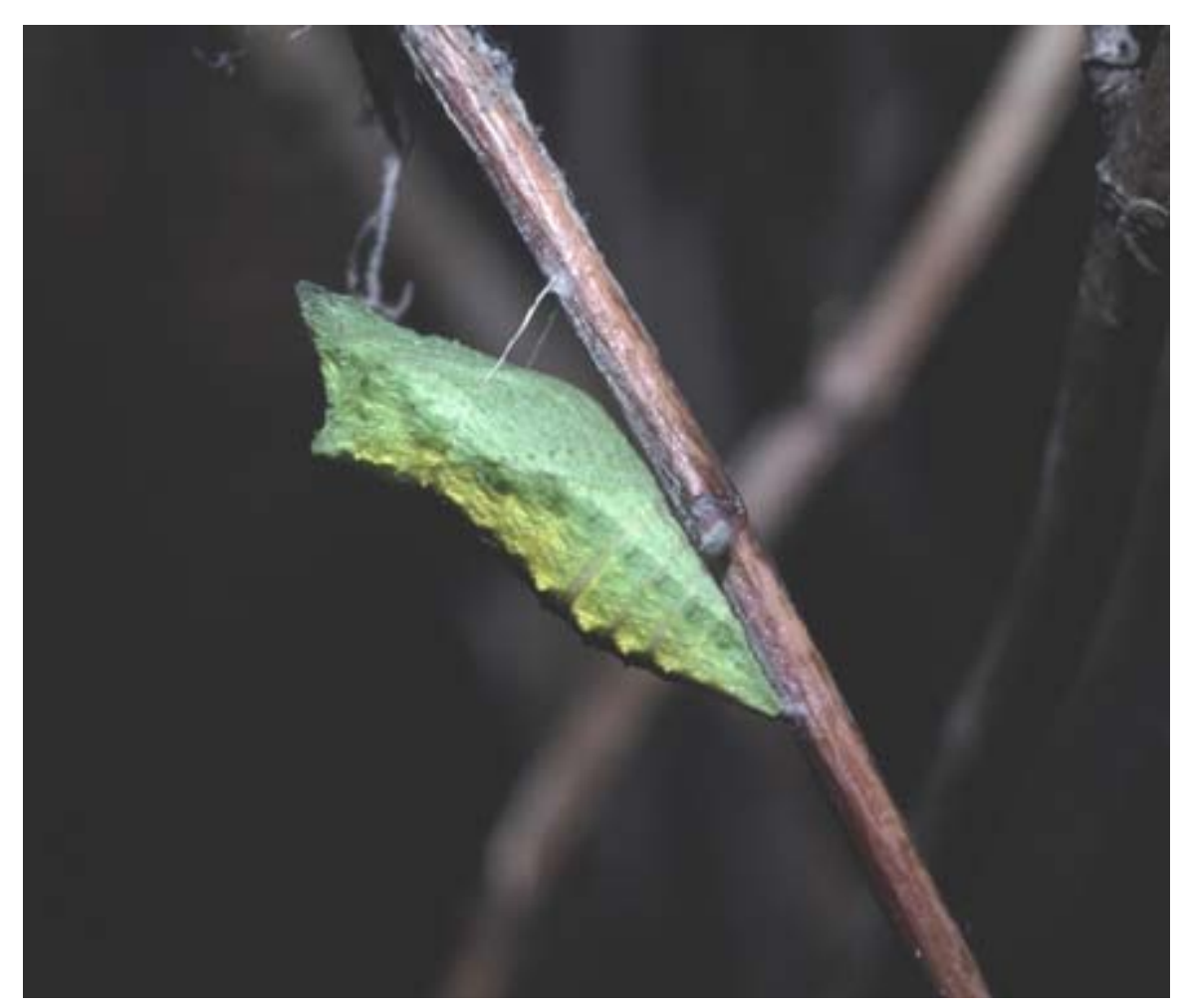
Depending on the species, butterflies overwinter as an egg, caterpillar, chrysalis, or adult. Those that overwinter as a chrysalis, such as this anise swallowtail, generally find sheltered vegetation on which to spend the winter months.

Stepping–stone habitat patches, which may be nothing more than "weeds" growing in a field margin or on a road verge, can meet these needs. A tolerant maintenance crew that leaves these areas to grow rather than cutting or spraying them may help provide the feeding or egg–laying resources these migrating pollinators require. So too with each small area of pollinator habitat created in parks and greenspaces. Left undisturbed, a patch of forage habitat or hostplants may reward you with the sight of a newly emerged butterfly warming its wings on a cool morning.