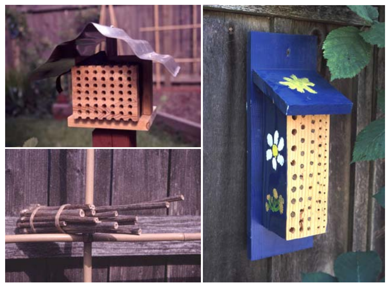
A selection of artificial nests for wood-nesting bees. Clockwise from top right: a commercially made mason bee nest constructed from a series of grooved boards; a hand-painted, multiple-hole-size block; a bundle of teasel stems.

together into a tight bundle with wire, string, or tape, or pack them into a box or pipe. Make sure the closed ends of the stems are at the same end of the bundle. Another variation is to tightly pack paper tubes—open ends out—into a milk carton or into a short section of PVC pipe in which the back end is sealed. The bundles should be placed in a sheltered location with the stems horizontal to the ground and the holes facing east to get the morning sun.