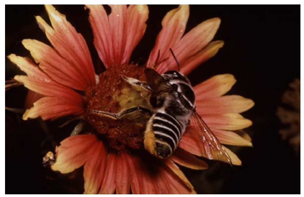
Bees provide flowers with the vital service of pollination. Native bees are the most important single group of pollinators in North America.

identified in the gardens of Albany and Berkeley, California. Parks are clearly important for pollinators.