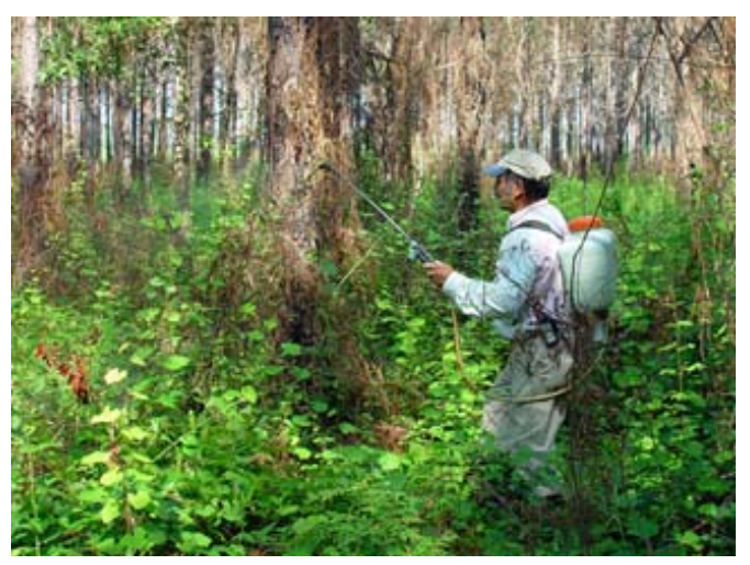
Pesticides impact pollinator insects in many ways. Reducing the risk from pesticides is an important step toward creating healthy habitats for pollinators.

The first step to protect pollinators is to reduce the need for pesticides. Pests can be controlled naturally, with a little patience on the part of staff. A healthy, diverse pollinator habitat has all the elements needed to encourage other beneficial insects, such as native predators or parasites of pest insects. The use of pesticides, however, often causes long-term problems by eliminating these natural enemies and upsetting the balance in the ecosystem. Whereas pests can quickly colonize and multiply in new areas of habitat, pollinators and beneficial predators may take years to return to pre-spray levels. In the weeks after an area is treated with insecticides, the pests will return, but beneficial insects will not.