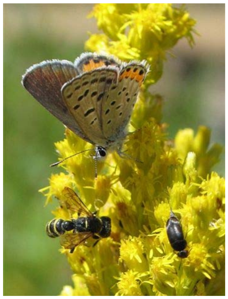
Valuable pollinators include (from lower left) wasps, butterflies, and beetles.

Another reason to focus on native bees and butterflies is that the natural history and habitat needs of these insects are better understood than those of pollinating flies or beetles. Consequently, there are well– established conservation techniques for bees and butterflies, practices that will also benefit other pollinators and species of wildlife.