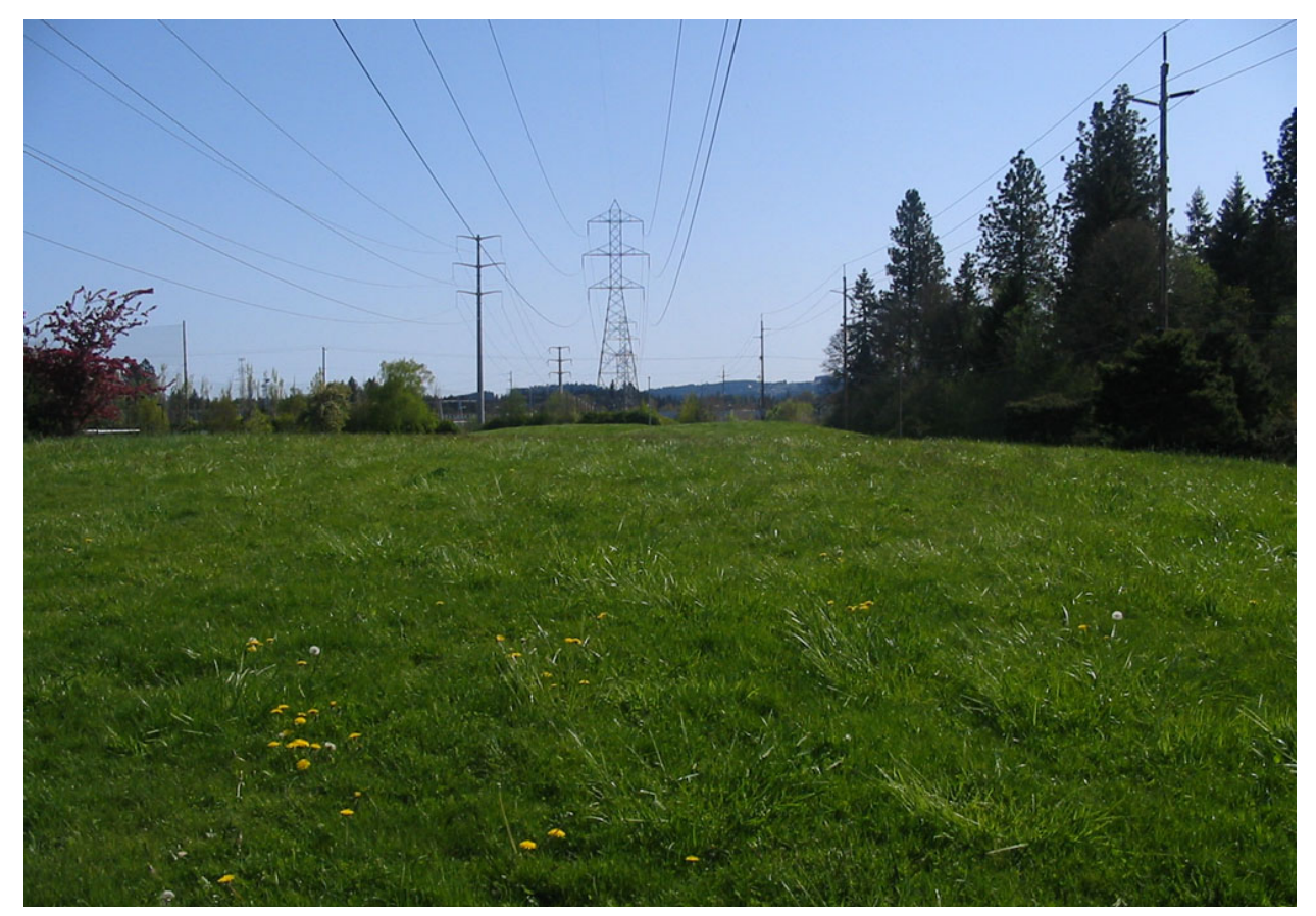
The wide–open spaces under power lines contain acres of grassland that could support abundant populations of butterflies, bees, and other pollinators.

The following sections cover in greater detail how to enhance habitat, how to provide necessary resources, and how specific park management practices may be altered to reduce negative impacts on our native pollinators.