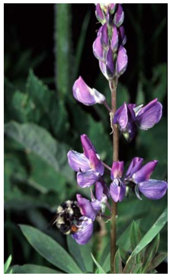
Different insects are able to reach nectar inside different shapes of flowers. Planting a diversity of flowers with a range of shapes—and colors—will support a diversity of pollinators.