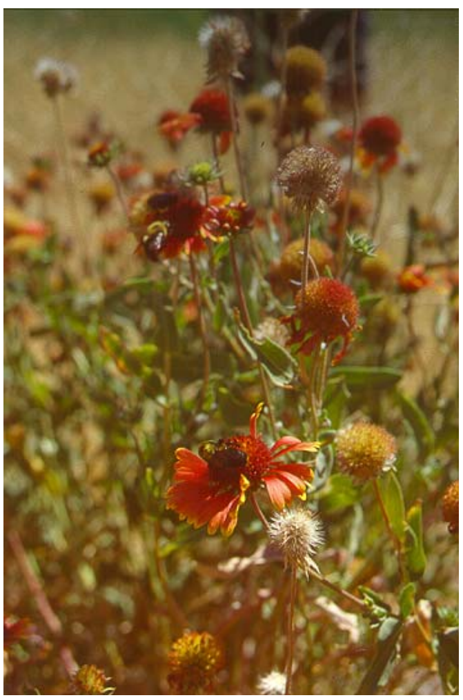
Protecting existing native plants, such as the blanket–flower shown here, or planting new patches of plants will beautify parks and increase forage for nectar–drinking insects.

Jim Cane and Vince Tepedino USDA–ARS Logan Bee Laboratory